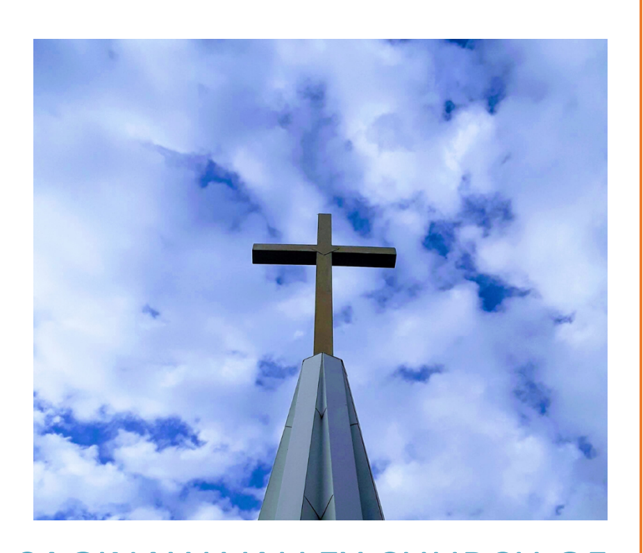
SAGINAW VALLEY CHURCH OF THE NAZARENE